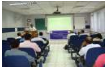
Symposium on "Nanotechnology" organized at IIT Delhi