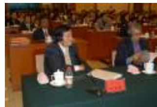
International forum on Talent, Training Trend in the context of Globalization at SINOPEC, China