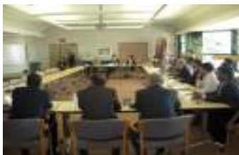
2nd Industry Educational Tour to University of Alberta, Canada