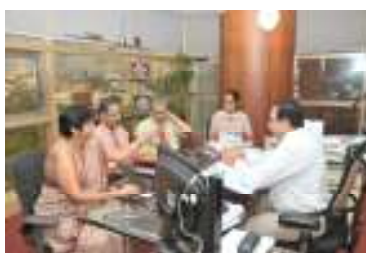
Convenor, Petrotech-2009 handing over Report to Convenor, Petrotech 2010