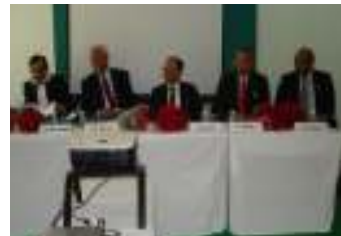
Inauguration of Petrotech Chapter at RGIPT Rae Bareilly