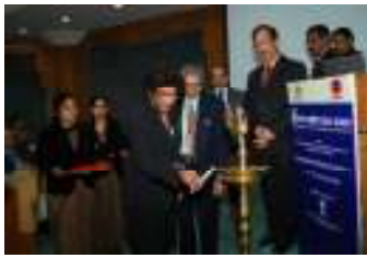
Inauguration of "Academia Industry Interface"