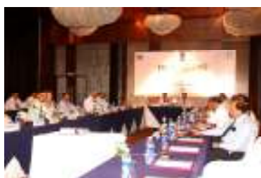
1st Core Group Meeting of PETROTECH 2010