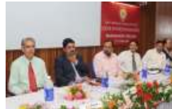
Management Conclave at Pandit Deendayal Petroleum University, Gandhinagar