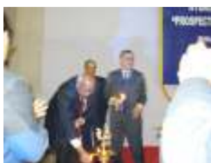
"Hydrocarbon Industry Growth-Prospects & Challenges in North East" Numaligarh Refinery, Assam