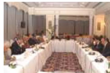
18 th Governing Council & 7 th Annual General Body Meeting of Petrotech Society held on 20 th November 2009

Petrotech society wishes all its patrons/associates a very Happy and Prosperous New Year!