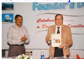
Launching of E-Newsletter and Release of Brochure