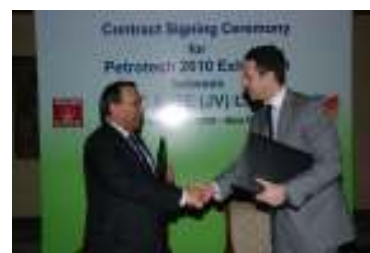
Signing of MoU between Petrotech- 2010 and ITE (JV), Ltd, UK (Exhibition Partner, Petrotech-2010