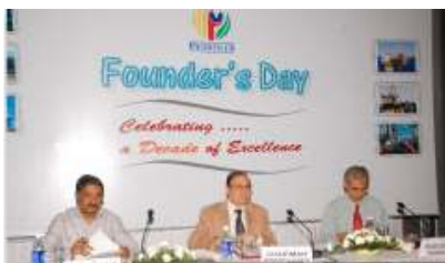
Petrotech Society celebrates a decade of Excellence