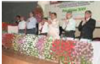
PETROVISION 2009 organized by PETROTECH Chapter at MIT Pune