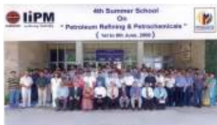
4th Summer School On "Petroleum Refining & Petrochemicals"