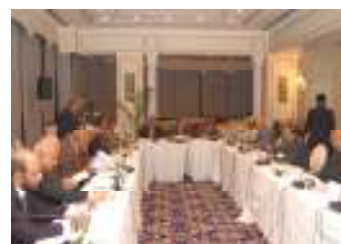
1st Meeting of Petrotech Veterans Forum