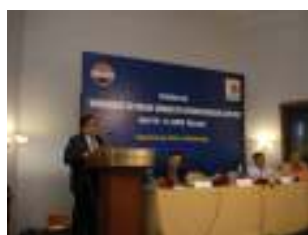
Inaugural Session of Seminar on "Advances in Value Chain of Hydrocarbon Sector" at south India